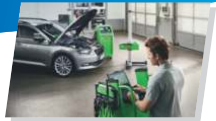
Bosch Certified Training Centre