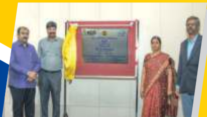
Intel IoT Lab