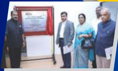
DST Supported FIST Lab