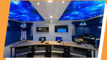
KCG Space Technology Center