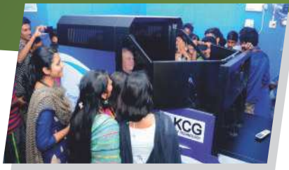
Link Flight Simulator