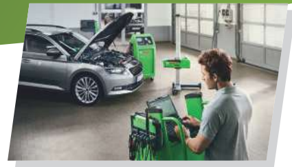
Bosch Certified Training Centre