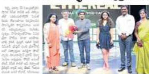
കെ.ജി.ടി.കാമ്പസിൽ 23-ആം ഡിഗ്രി ഡേ ചടങ്ങുകൾ നടന്നു. ചടങ്ങിൽ പങ്കെടുത്തവർക്ക് 915 ഡിഗ്രി ഡേ ബിരുദങ്ങൾ കൈമാറി.