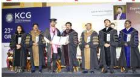
കെ.ജി.ടി.കാമ്പസിൽ 23-ആം ഡിഗ്രി ഡേ ചടങ്ങുകൾ നടന്നു. ചടങ്ങിൽ പങ്കെടുത്തവർക്ക് 915 ഡിഗ്രി ഡേ ബിരുദങ്ങൾ കൈമാറി.