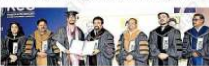
കെ.ജി.ടി.കാമ്പസിൽ 23-ആം ഡിഗ്രി ഡേ ചടങ്ങുകൾ നടന്നു. ചടങ്ങിൽ പങ്കെടുത്തവർക്ക് 915 ഡിഗ്രി ഡേ ബിരുദങ്ങൾ കൈമാറി.

കെ.ജി.ടി.കാമ്പസിൽ 23-ആം ഡിഗ്രി ഡേ ചടങ്ങുകൾ നടന്നു. ചടങ്ങിൽ പങ്കെടുത്തവർക്ക് 915 ഡിഗ്രി ഡേ ബിരുദങ്ങൾ കൈമാറി. കെ.ജി.ടി.കാമ്പസിൽ 23-ആം ഡിഗ്രി ഡേ ചടങ്ങുകൾ നടന്നു. ചടങ്ങിൽ പങ്കെടുത്തവർക്ക് 915 ഡിഗ്രി ഡേ ബിരുദങ്ങൾ കൈമാറി.