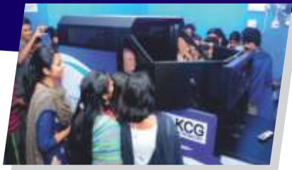
Link Flight Simulator