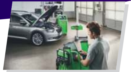
Bosch Certified Training Centre