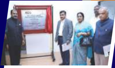
DST Supported FIST Lab