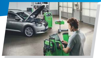
Bosch Certified Training Centre