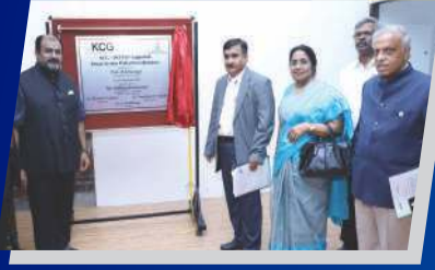
DST Supported FIST Lab