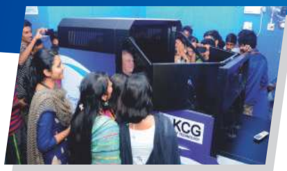
Link Flight Simulator