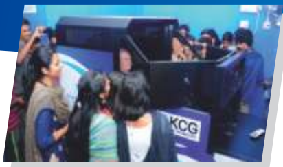
Link Flight Simulator