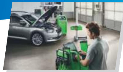
Bosch Certified Training Centre