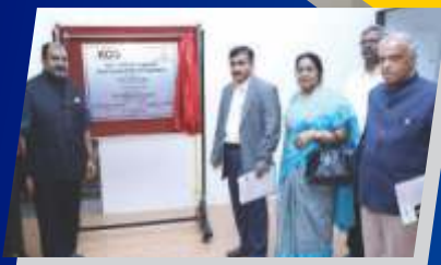
DST Supported FIST Lab