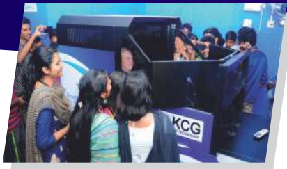
Link Flight Simulator