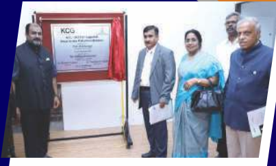
DST Supported FIST Lab