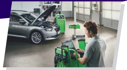
Bosch Certified Training Centre