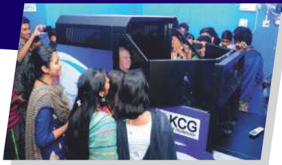
Link Flight Simulator