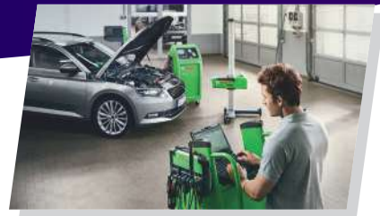
Bosch Certified Training Centre