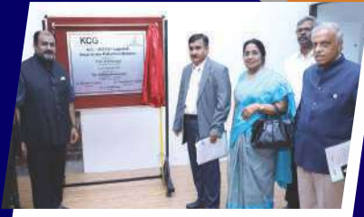
DST Supported FIST Lab