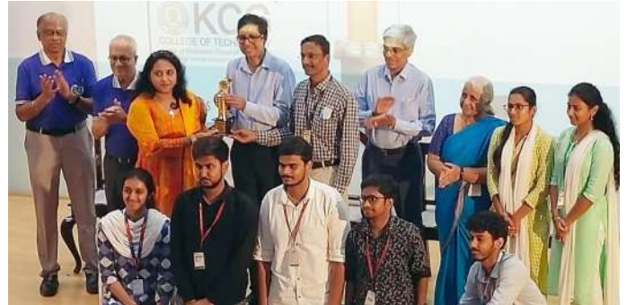
KCG College of Technology received the award "Best Partner Institute of the year 2021-2022" the prestigious and highest award from IIT PALS..