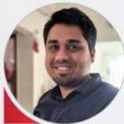
ARAVINDAN Evoqua Water Technologies