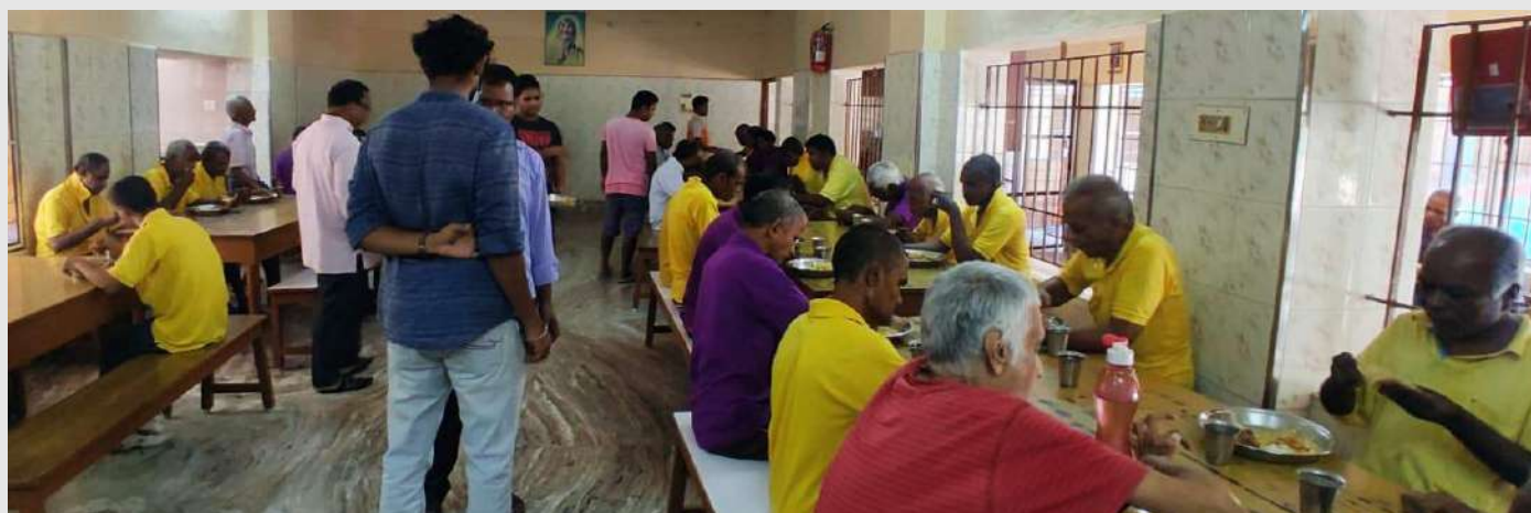
Lunch to the Inmates of an Old Age Home at Little Mount, run by Missionaries of Charity