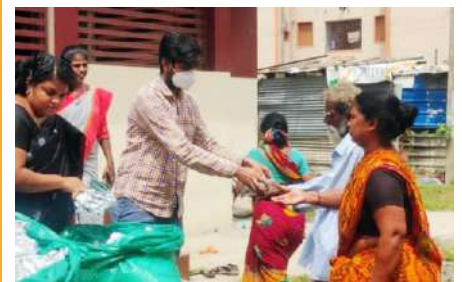
Food distributed to 10,000 poor and needy in 100 orphanages