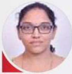
SRI DEVI T HCL