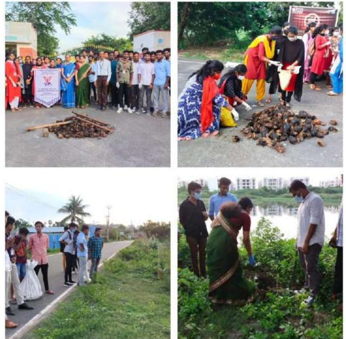
Palm Seeds Sowing Project in collaboration with Engineers without Borders (EWB) and Y's Service Club of Chennai, Karapakkam. 500 palm seeds sown along lake side of college road