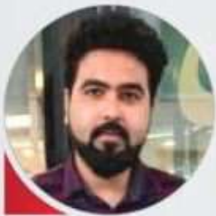
GRANDIN MAJOR TCS