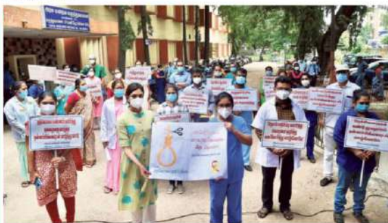
An awareness rally conducted at the Institute of Mental Health on World Suicide Prevention Day.

"Previously, faculty members would pick up cues from the students' behaviour and refer them to the Student Counsellor. That has changed with online classes. Hence this