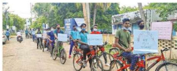
Students taking part in a cycle rally