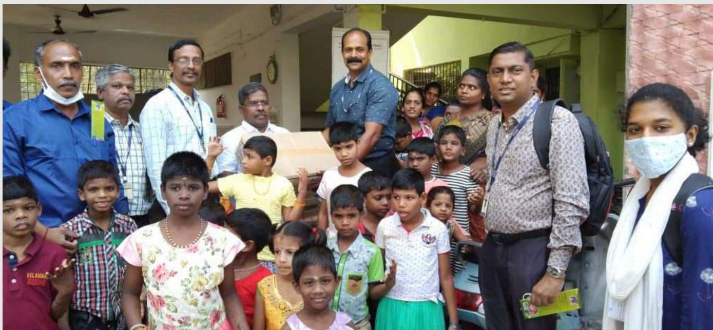
Monthly provision worth Rs. 50,000 to Premavasam, a home for special children at Girugambakkam