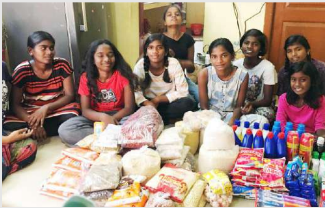
Monthly Provision to ARK Service Society