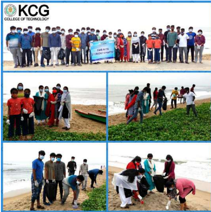
Engineers without Borders (EWB) India- Students Chapter of the college organized a Coastal Clean Up Day on 18th September 2021.