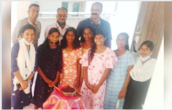
Christmas Celebration with HIV afflicted children of ARK Service Society