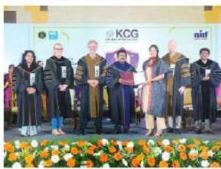
A rank holder presented with a degree at the graduation ceremony of KCG College of Technology

Research Brochure, Erik Solheim delivered the Graduation Day Address. In his address he suggested Mahatma Gandhi as an ideal role model to follow for his contributions to India in fighting the strong British colonial rule with non-violence. He also fervently encouraged the graduands to work towards and contribute to establishing an Ecological Civilization. His final advice to the graduands was to "Be kind, work hard and never stop being curious".